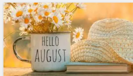
August EAP Newsletter