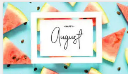
August EAP Webinars