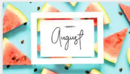
August EAP Webinars