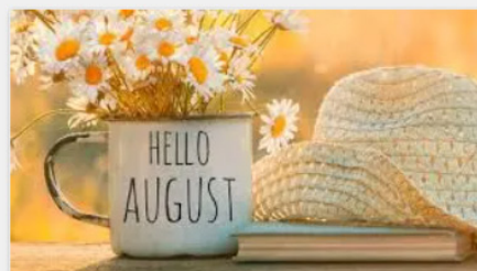
August EAP Newsletter