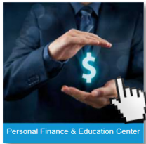
Personal Finance & Education Center

Your EAP benefit now includes one-on-one Personal Financial Coaching. Engage with a certified Personal Finance coach to help with student debt, home purchasing, saving and spending, retirement planning and creating a budget. Call 800-252-4555 to connect with a Coach.