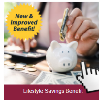
New & Improved Benefit!

Find more than a hundred online calculators to help with budgeting and saving. If you are planning on a new car, thinking about buying a home, or trying to build a savings plan, you'll find the calculators you need to make the best decisions. Click on the 'Calculators' tile.